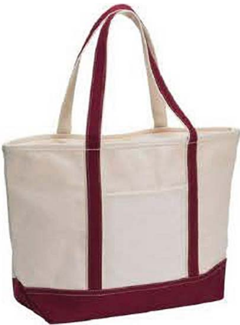
Zipper Beach Tote