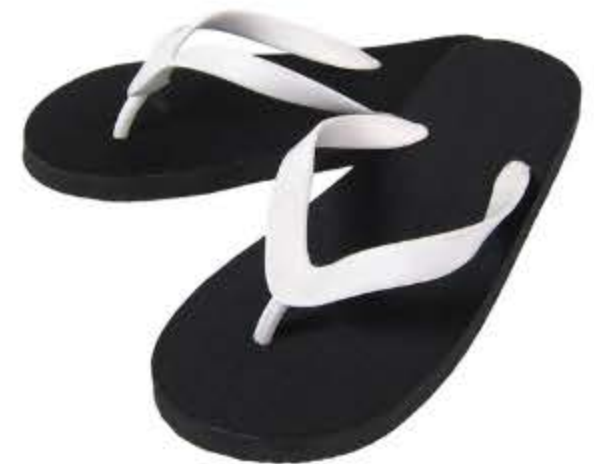
Laguna Flip Flops