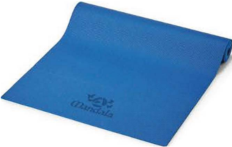
Custom Yoga Mat