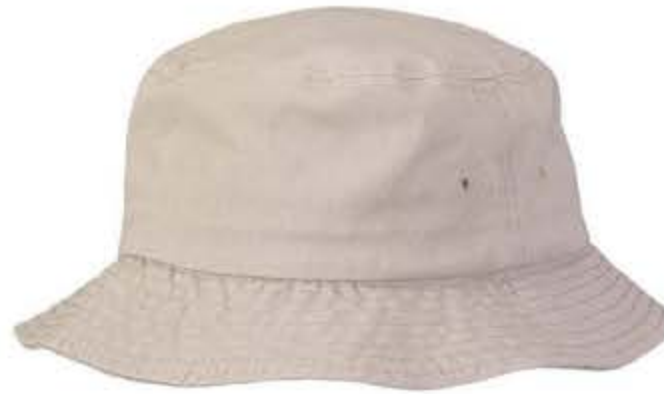
Sportsman Bucket Hat