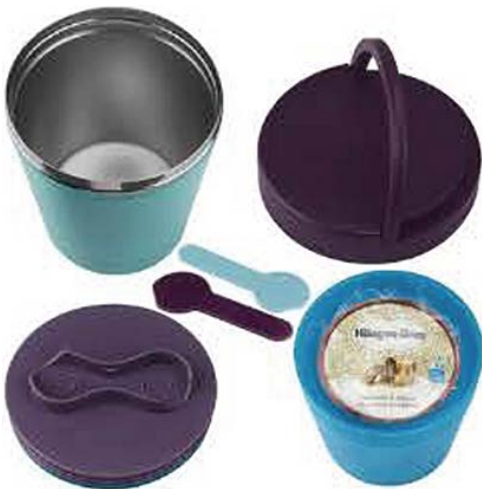
Asobu Ice Cream Keeper