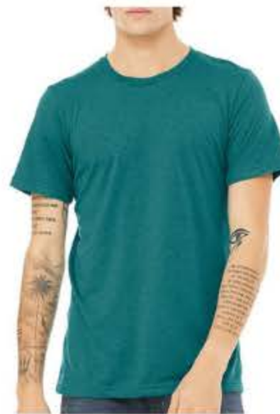
Swag.com Triblend Crew