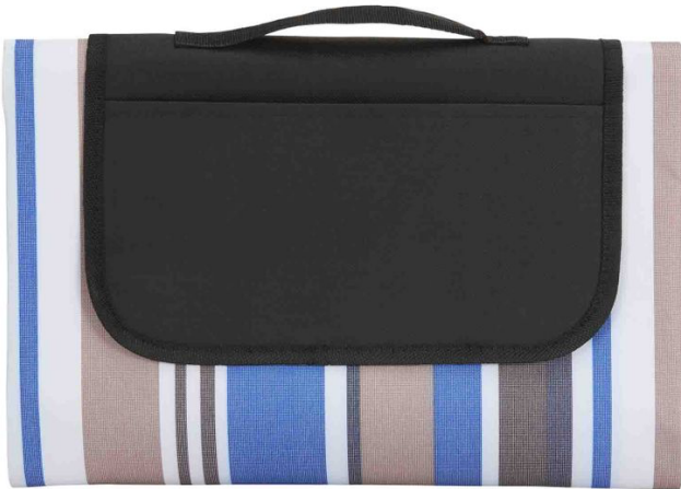
Picnic & Beach Blanket