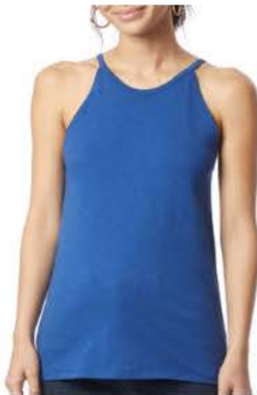
Alternative Sporty Tank