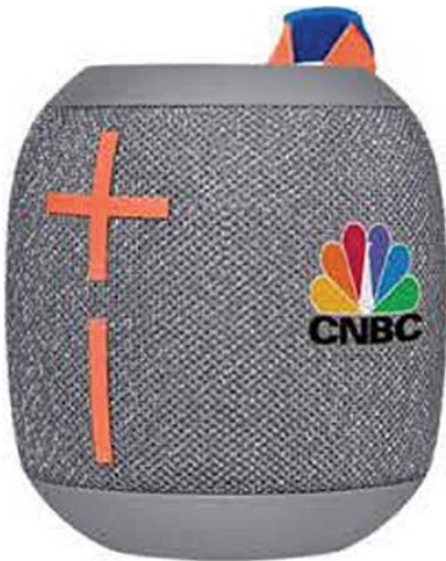
WonderBoom Bluetooth Speaker